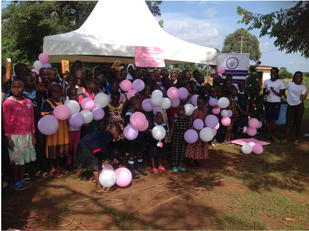
FINAL DAY OF THE BIBLE CAMP WITH BALOON BURSTING