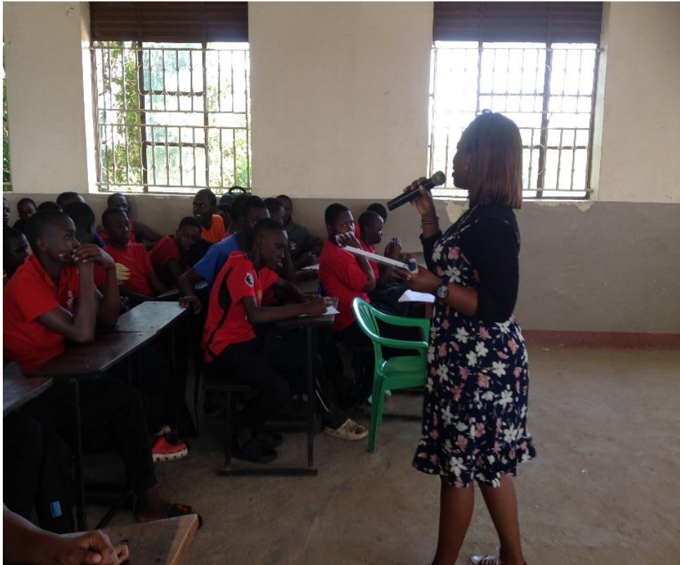
KEREN A PPI ALUMNI SHARING WITH LEARNERS ABOUT RELATIONSHIPS