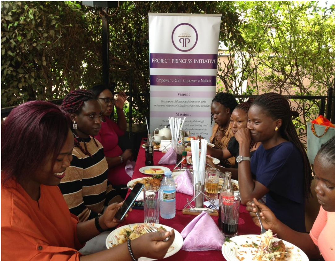
PPI RE-UNITES THE BIG GIRLS FOR A LUNCH