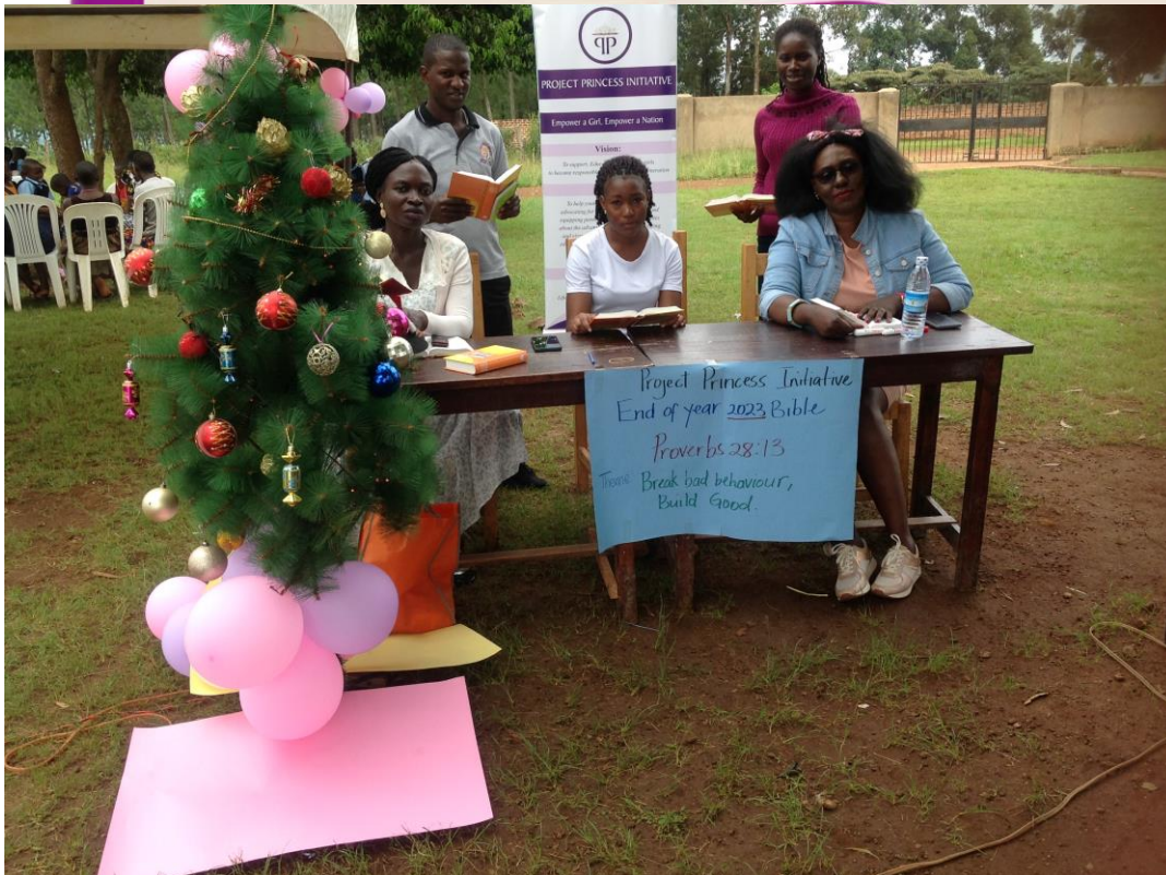
PPI TEAM GETTING READY TO ENGAGE GILS IN THE BIBLE CAMP