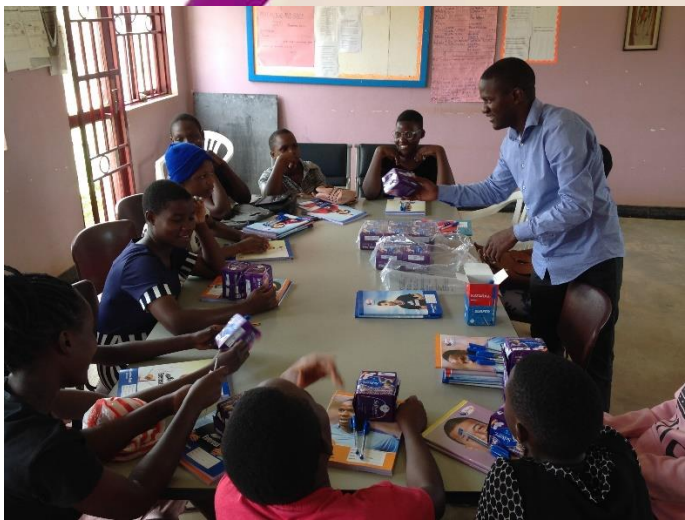
GIRLS RECEIVE SCHOLASTIC MATERIAL TO KEEP IN SCHOOL