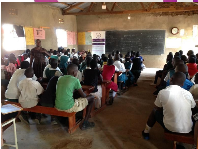
START YOUNG PROSPER YOUNG WITH FINANCIAL LITERACY TO LEARNERS