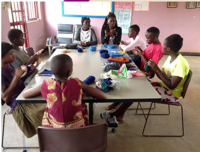
CROCHET TRAINING AT THE CENTRE