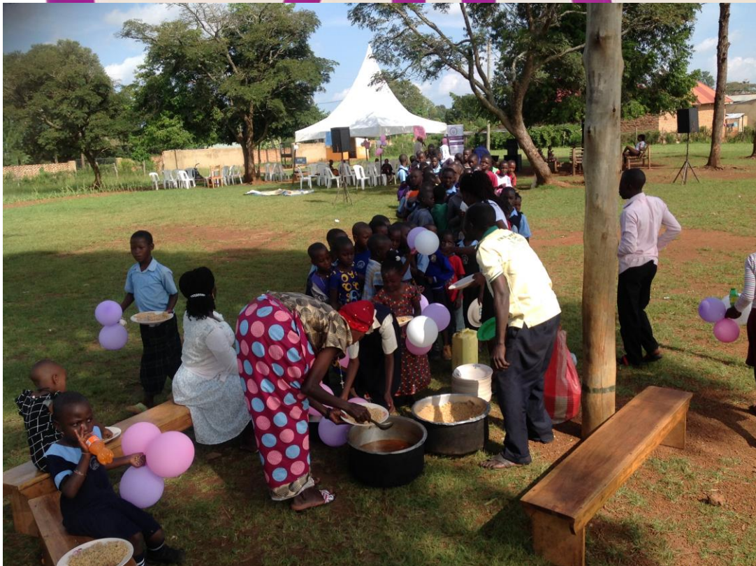
PARTY TIME WITH PRINCESSES