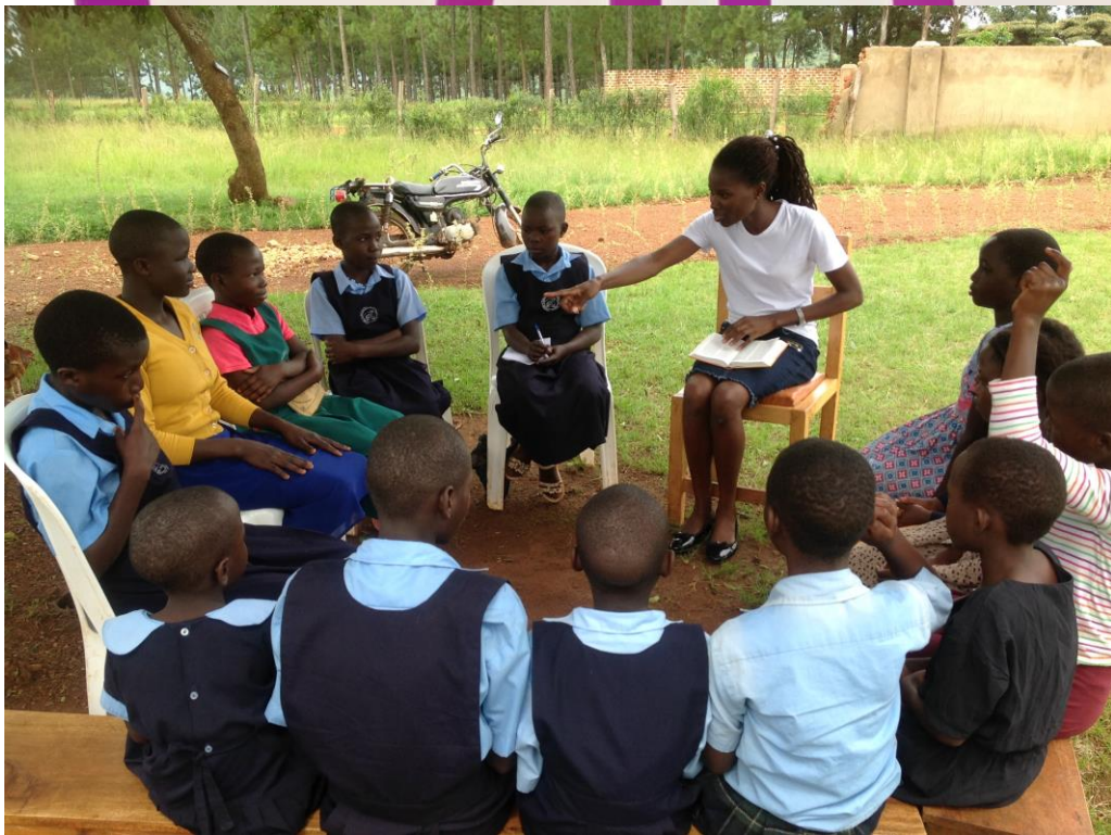
PPI STAFF GETS INTO ACTIVE BIBLE PARTICIPATION WITH THE GIRLS