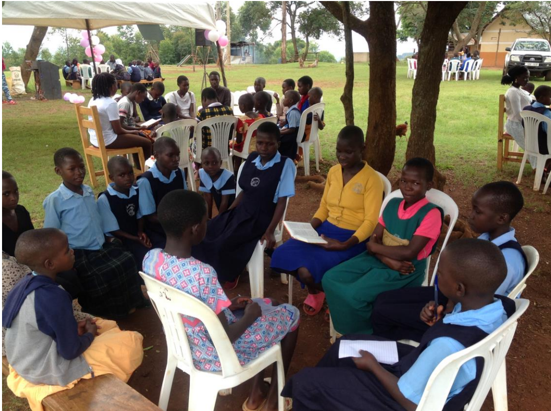
GIRLS ORGANISED IN GROUPS DURING BIBLE RECITATIONS