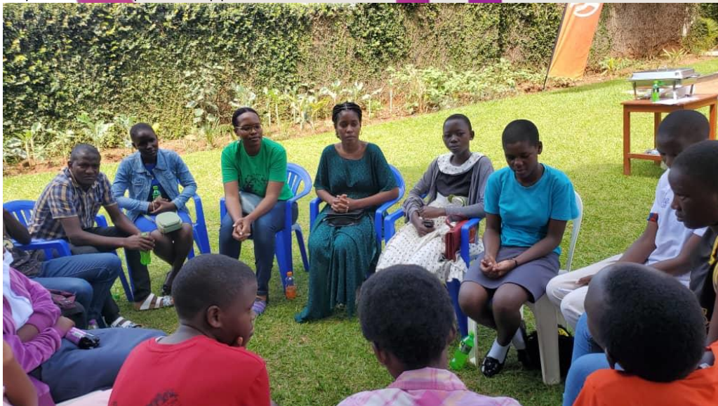
GIRLS RECEIVING GUIDANCE AND COUNSELING TOWARDS STAYING IN SCHOOL

Four vulnerable parents from Project Princess Initiative converged at Concern for the Girl Child offices in Ntinda with 20 other parents and received an Easter package from Friends of Malaika a charitable organization. Easter packages included sensitizing parents about fulfilling their roles, motivating girls to achieve success, books, cooking oil, washing soap, rice, posho, sugar and clothes. It was an awesome day and the PPI parents appreciated the care PPI has for vulnerable mothers.