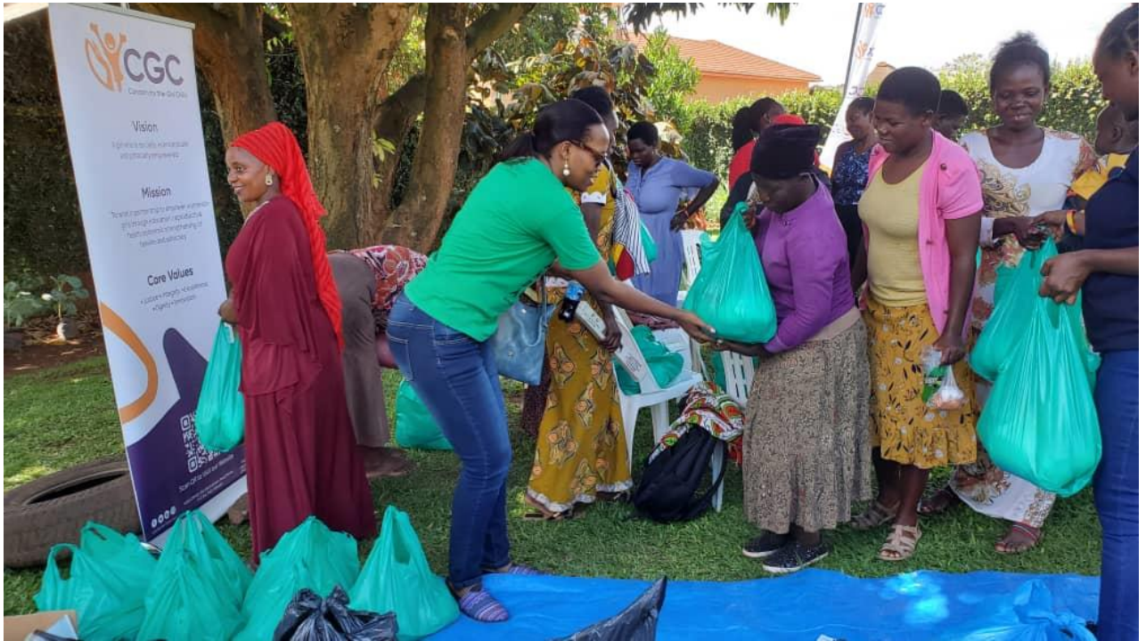
PARENTS TO THE VULNERABLE GIRLS RECEIVING THEIR EASTER HAMPER FROM CONCERN FOR THE GIRL CHILD IN PARTNERSHIP WITH PROJECT PRINCESS INITIATIVE