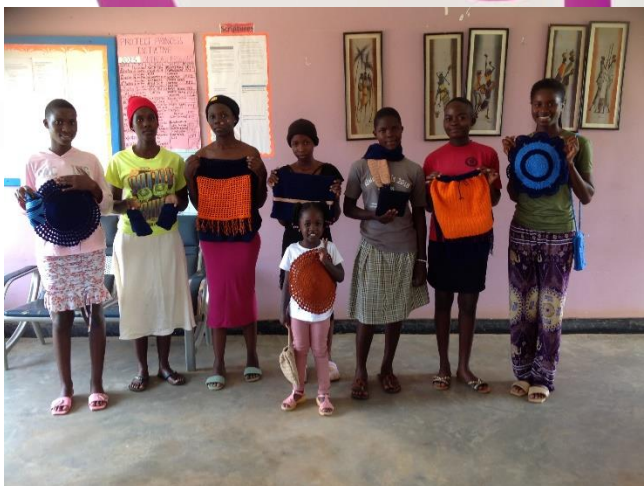
GIRLS DISPLAY FINISHED CROCHET PRODUCTS