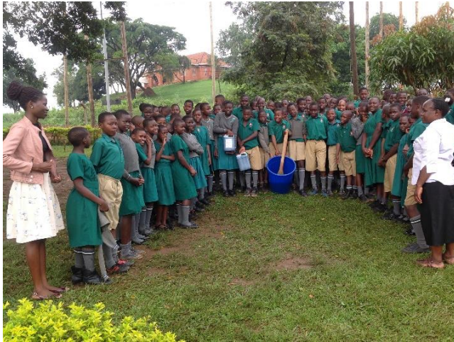
LIQUID SOAP MAKING AT KIRA PRIMARY SCHOOL