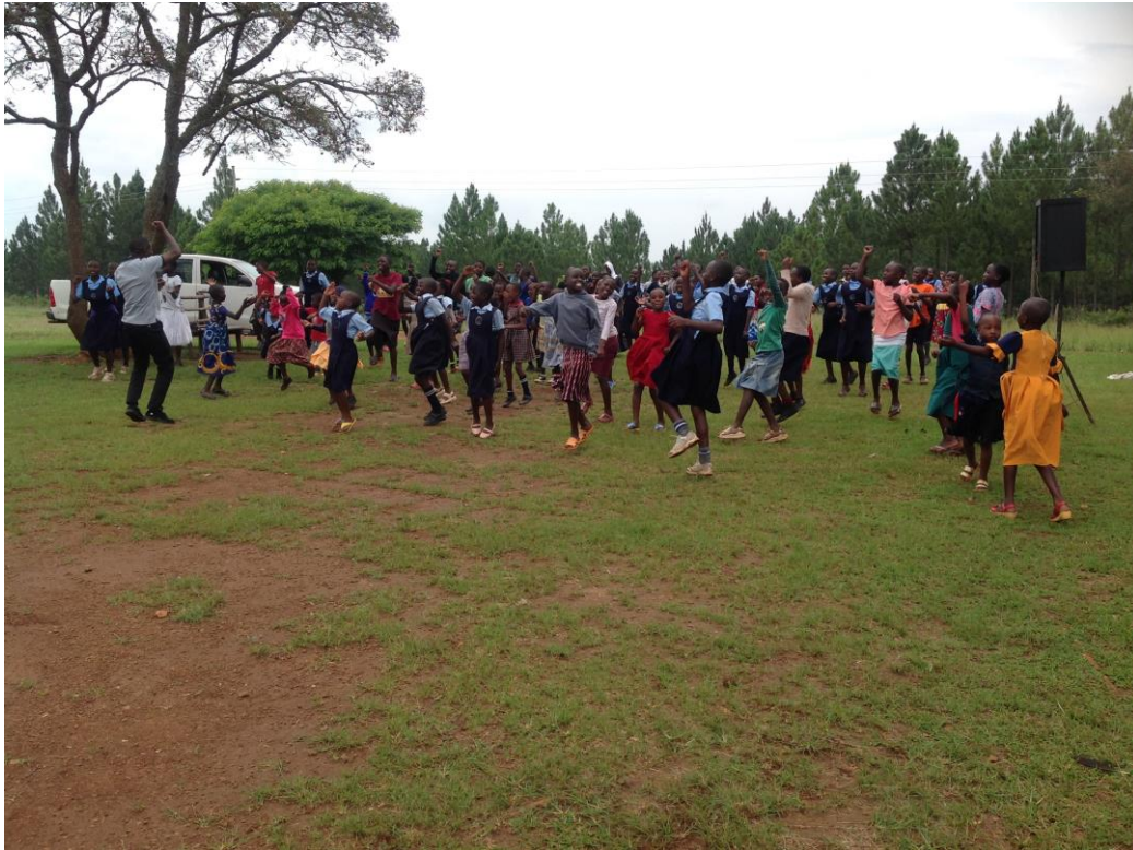
GIRLS AT HOPE HILL DURING AEROBICS CLASSES ON DAY 1 OF THE BIBLE CAMP