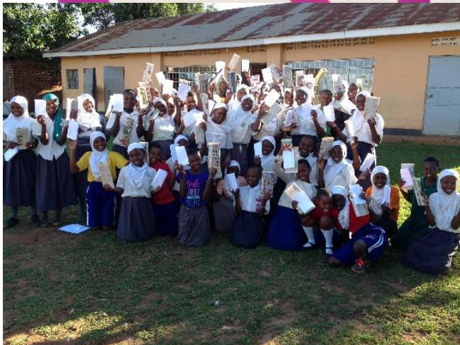
UMEA GIRLS DISPLAY FINISHED PAPER BAGS

In the previous years, Girls were always hosted at the project Centre for skills development BUT later PPI realized that most girls resided far away from the Centre, the idea of providing skills to Girls in schools was initiated since the coverage of skills in schools was easy to monitor. Therefore, in the year 2023, skills development was carried out from schools as below;