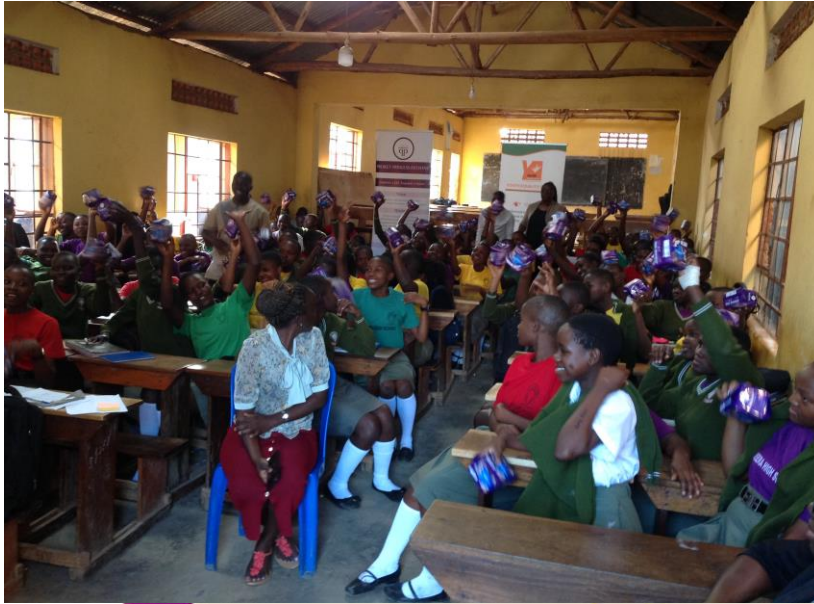
NAJEERA HIGH SCHOOL CELEBRATES MENSTRUATION DAY 2022